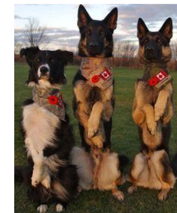
We Will Never Forget