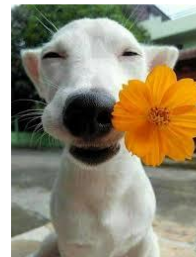
A SMILE COULD MAKE SOMEONES DAY