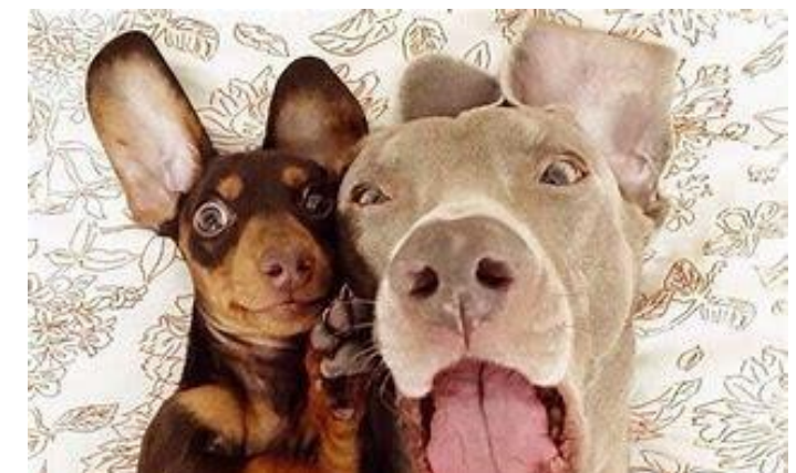
Just a Little Something to make You Smile

"Cast all your anxiety on him because he cares for you." — 1 Peter 5:7