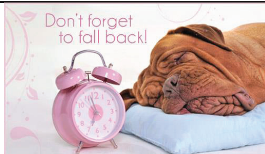
Don't forget clocks go back next Sunday

Missals are available for purchase in the little store at the back of the church, or from the parish office. The cost is $7.00. Please put money in the box provided. Thank You