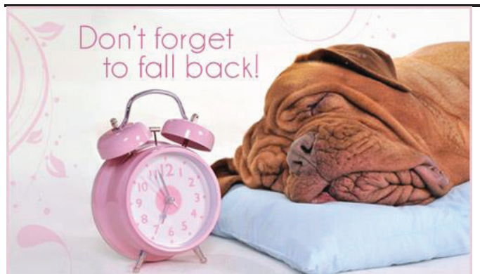
Don't forget clocks go back next Sunday

There will be a second collection next weekend Nov 4 th and 5 th for the Maintenance and Building